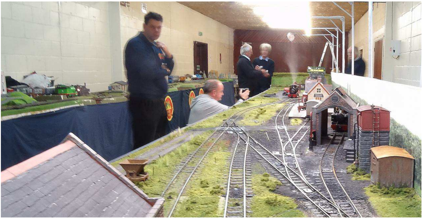
Chopper couplings are used to enable auto uncoupling using track magnets. The layout is a narrow gauge, end to end, small terminus to fiddle yard: 4ft wide by 34ft long including 7 track sliding traverser fiddle yard.